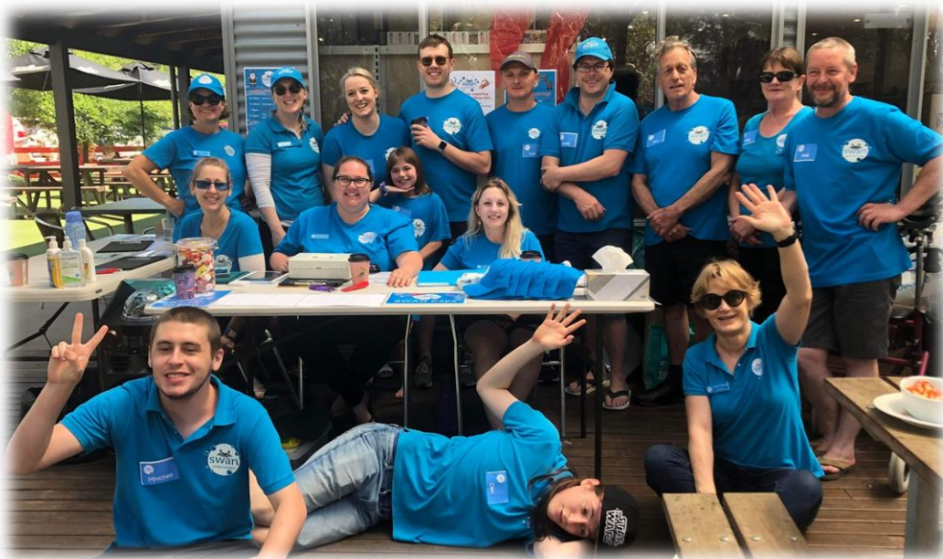
The SWAN Crew and volunteers at the SWAN Family Christmas Party 2021