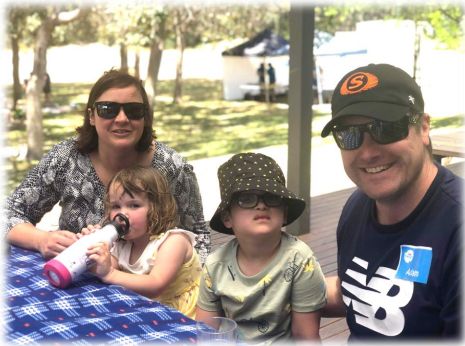
Families enjoying the SWAN Family Christmas Party, November 2021