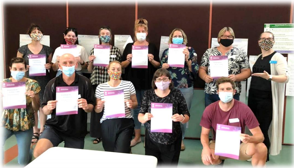
Youth Mental Health First Aid training attendees March 2022