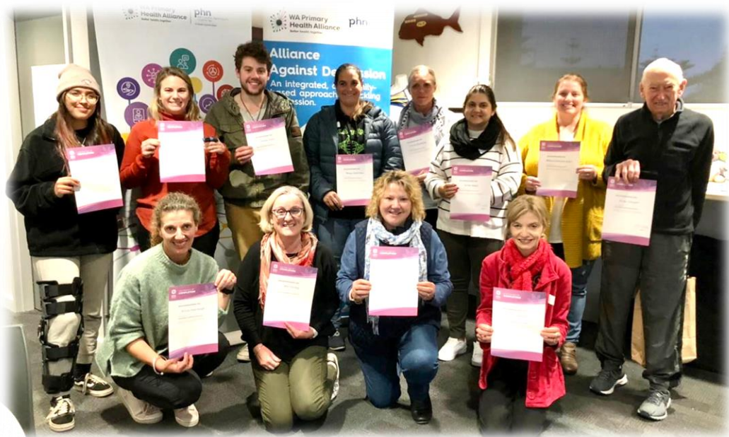
Youth Mental Health First Aid training in partnership with Busselton-Dunsborough Alliance Against Depression (BDAAD) June 2022