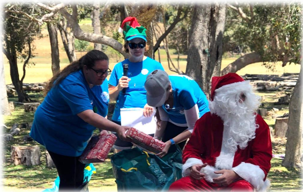
Santa and elves giving out gifts at the SWAN Family Christmas Party 2021