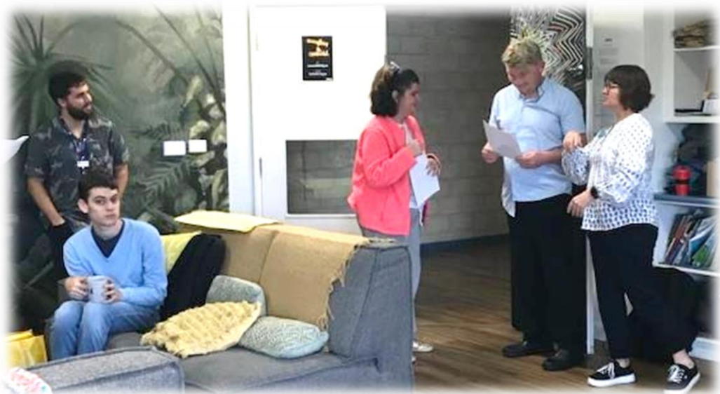
Some of the JumpStart Crew rehearsing 2022