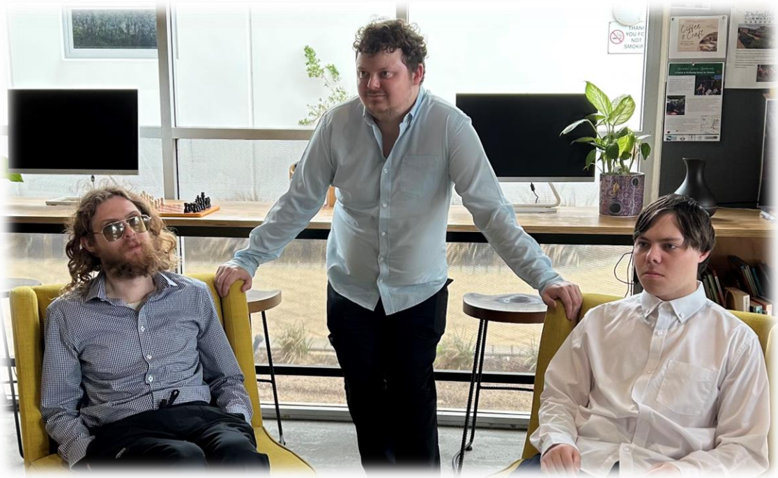
JumpStart Crew members working on the film-making project 2023.