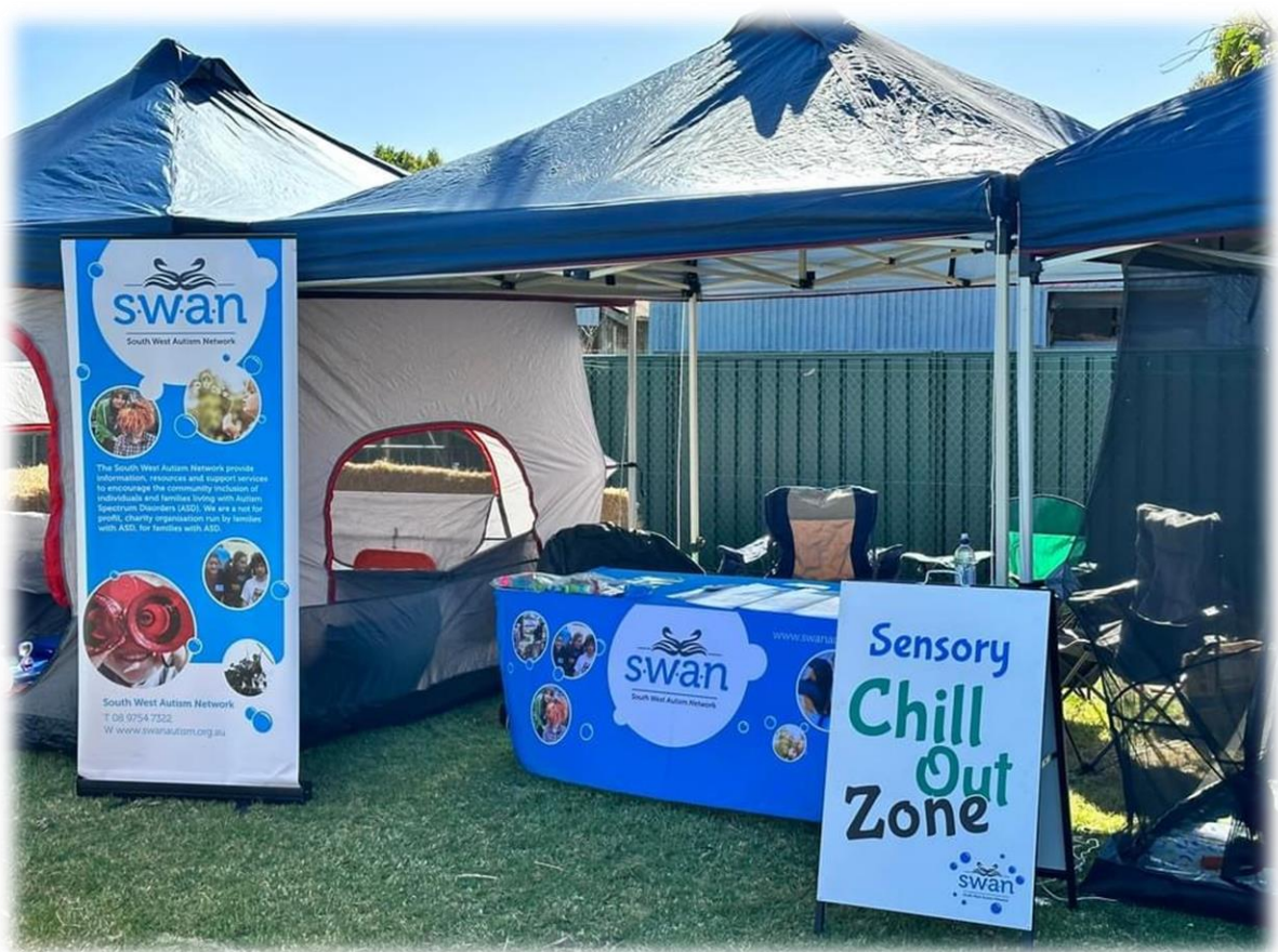
The SWAN Sensory Chill Out Zone 2023

Our two ILC projects will continue until June 2024, enabling SWAN to focus on building individual capacity to self-advocate, engage with NDIS processes, access mainstream and disability services, and self-manage NDIS funding. Our JumpStart project enabled SWAN to employ 16 young adults with disability to create 15 short educational films. This project is well under way with plans to celebrate the premiere of the films in the first half of 2024. Four Autism Go-To Guides have been developed as part of our Regional Toolkit project, in addition to many articles and fact sheets on our website.