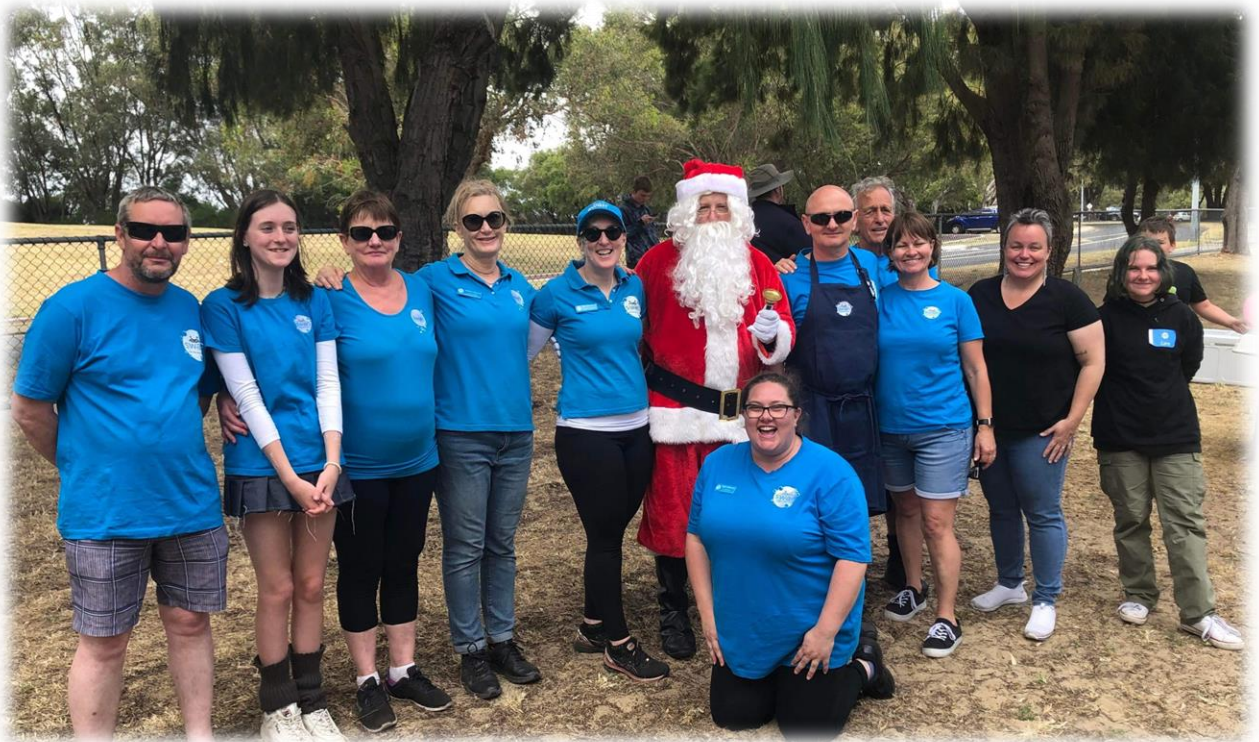
Santa and most of the SWAN elves at the SWAN Family Christmas Party 2022