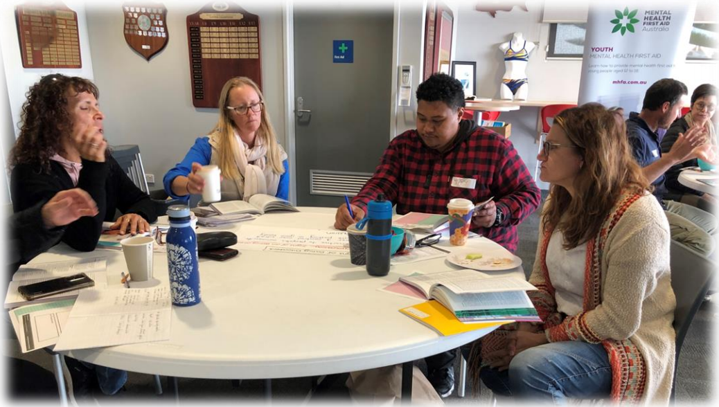
Youth Mental Health First Aid training in partnership with Busselton-Dunsborough Alliance Against Depression (BDAAD) May 2023