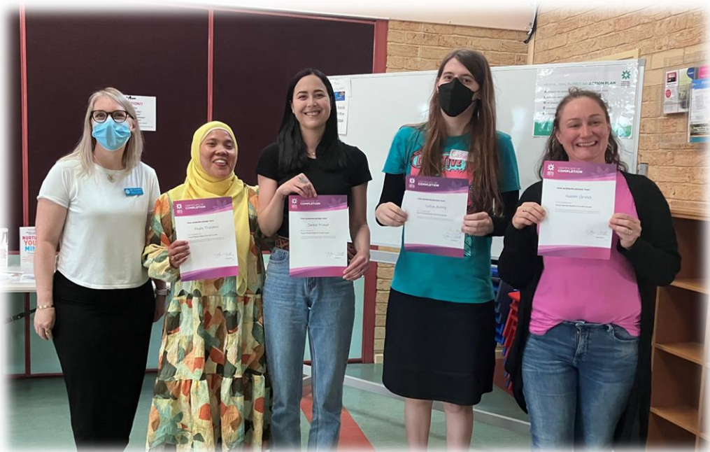
Youth Mental Health First Aid training in partnership with Investing In Our Youth (IIOY) October 2023