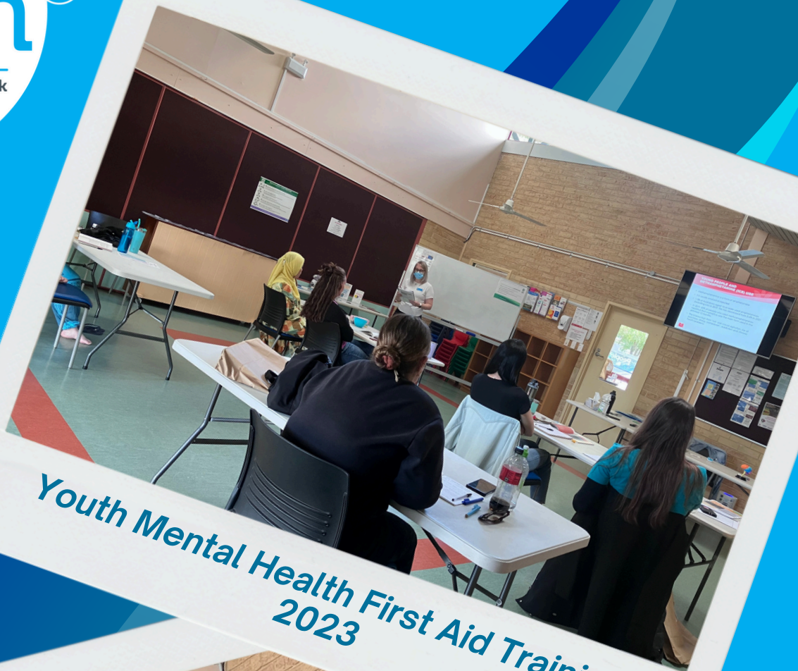
Youth Mental Health First Aid Training 2023