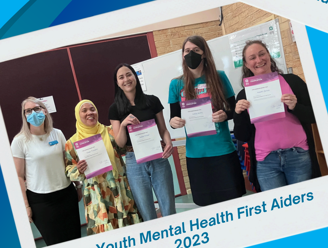
New Youth Mental Health First Aiders 2023