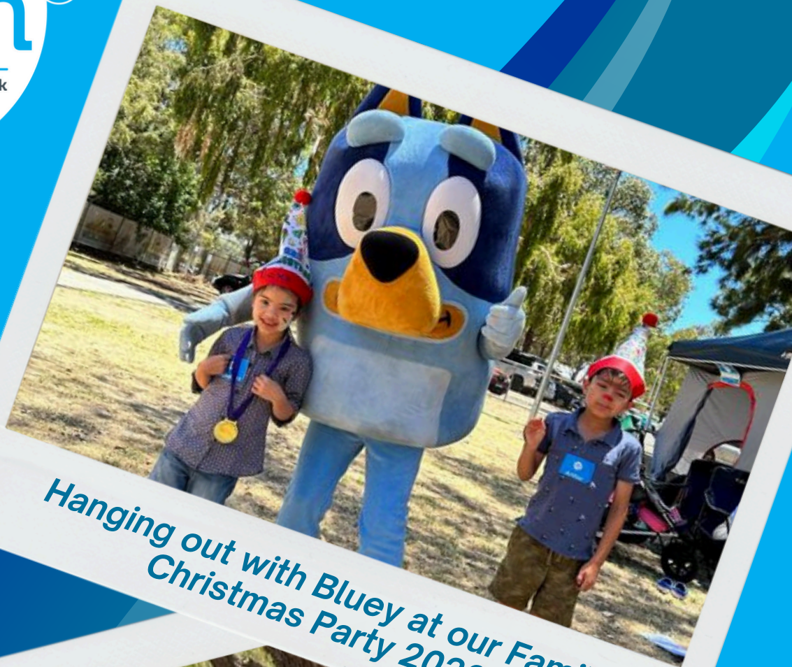
Hanging out with Bluey at our Family Christmas Party 2023