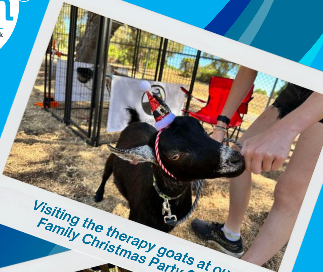
Visiting the therapy goats at our Family Christmas Party 2023