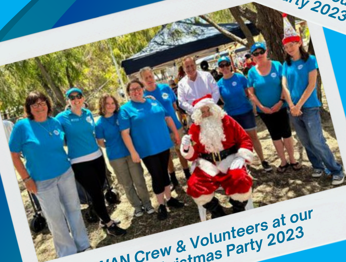
SWAN Crew & Volunteers at our Family Christmas Party 2023