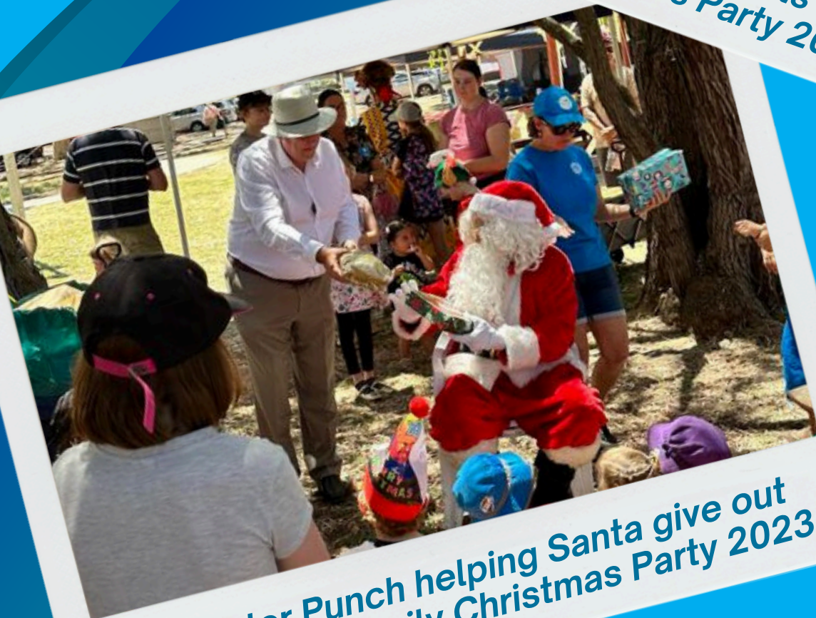
Minister Punch helping Santa give out gifts at our Family Christmas Party 2023