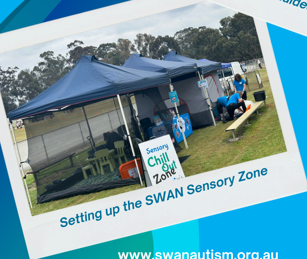
Setting up the SWAN Sensory Zone