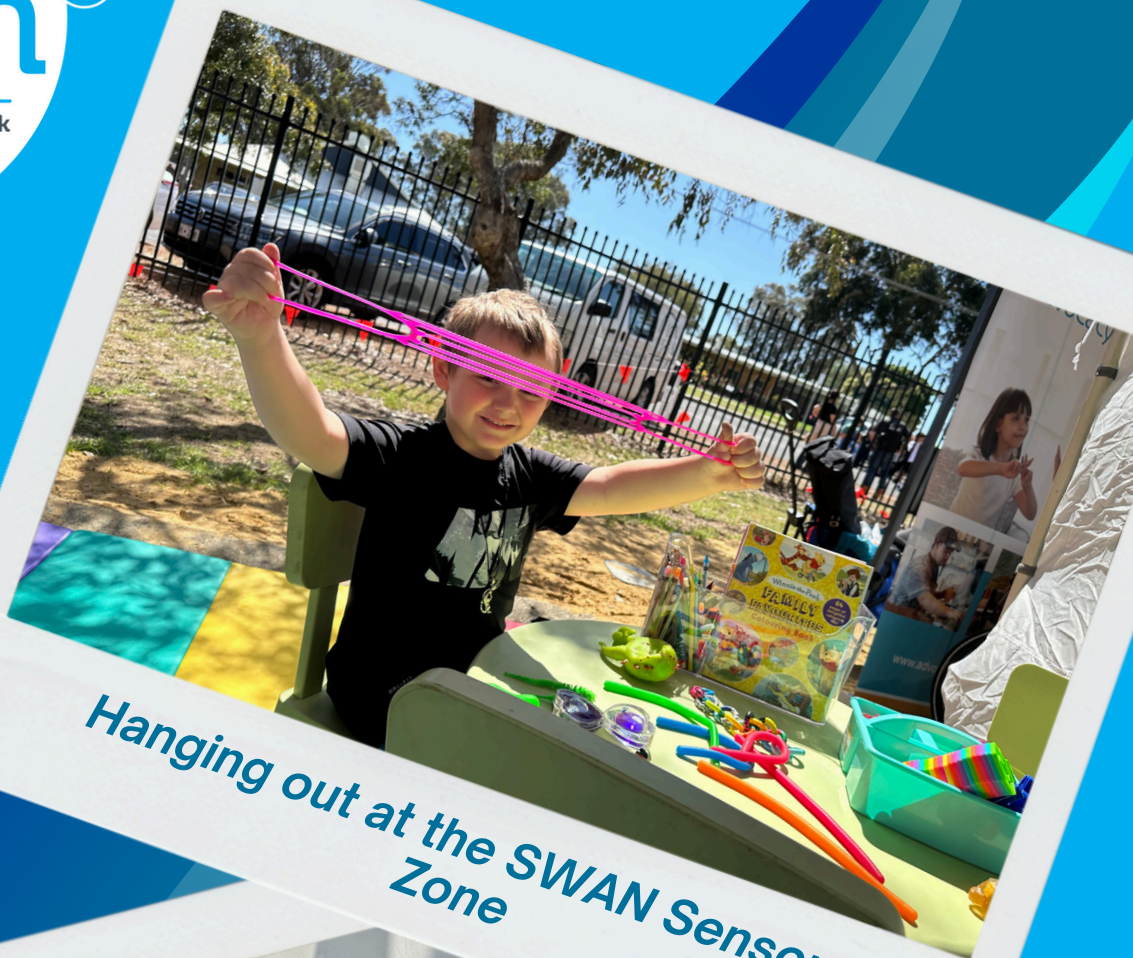
Hanging out at the SWAN Sensory Zone