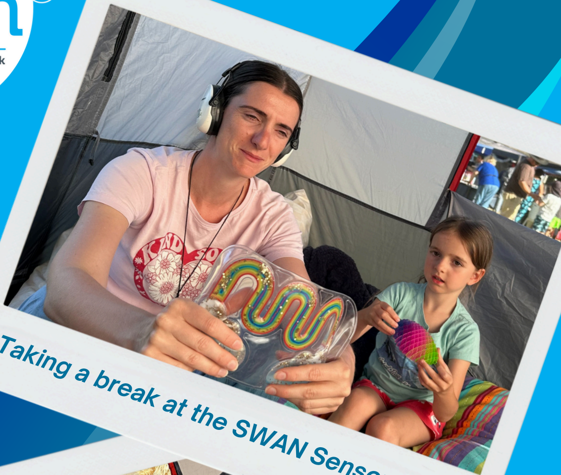
Taking a break at the SWAN Sensory Zone