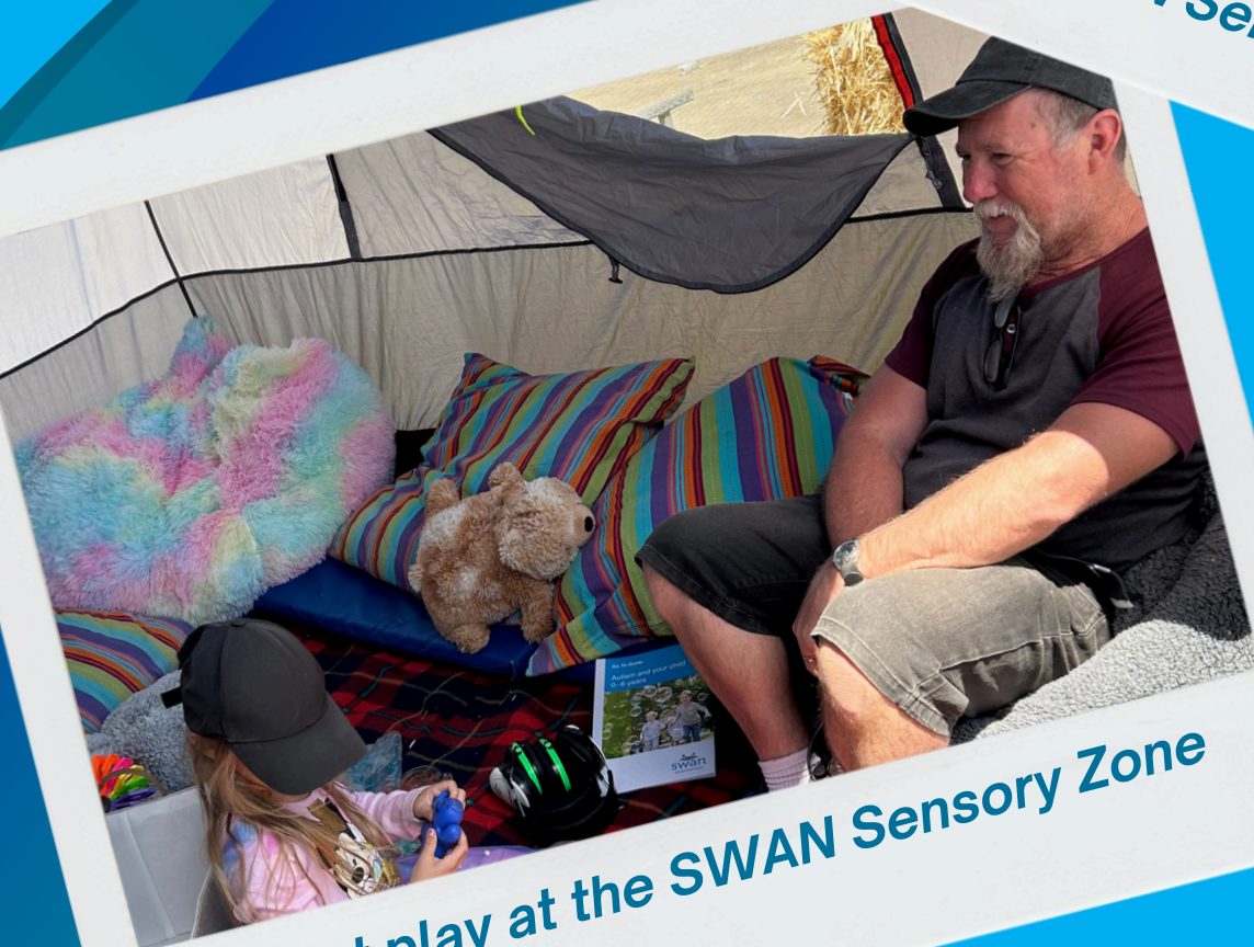
Quiet play at the SWAN Sensory Zone