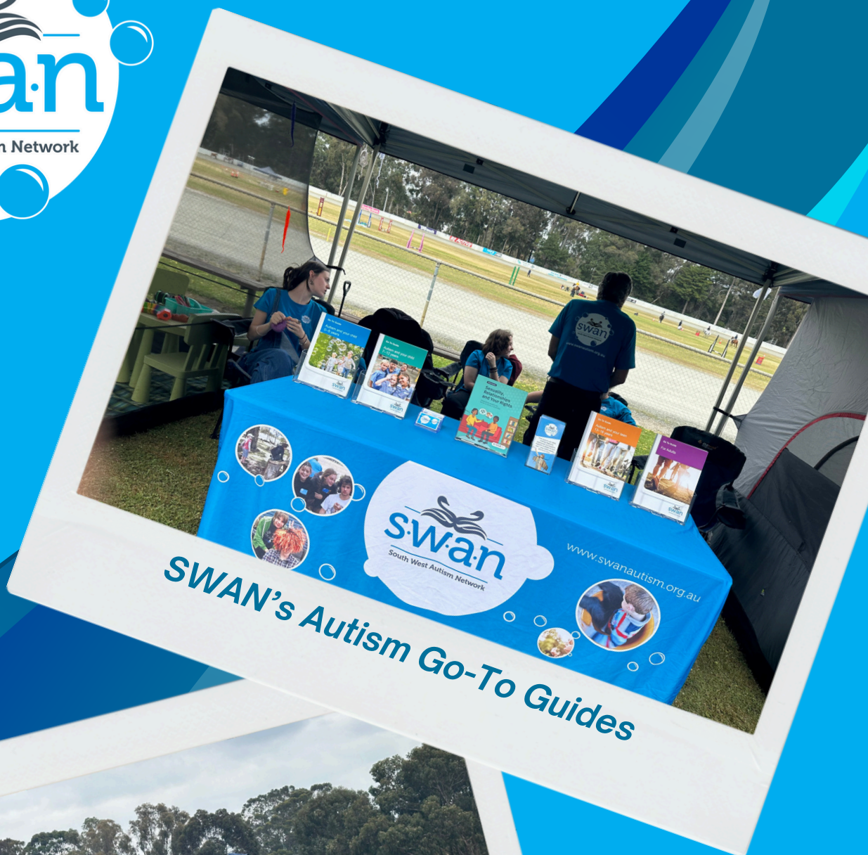
SWAN's Autism Go-To Guides