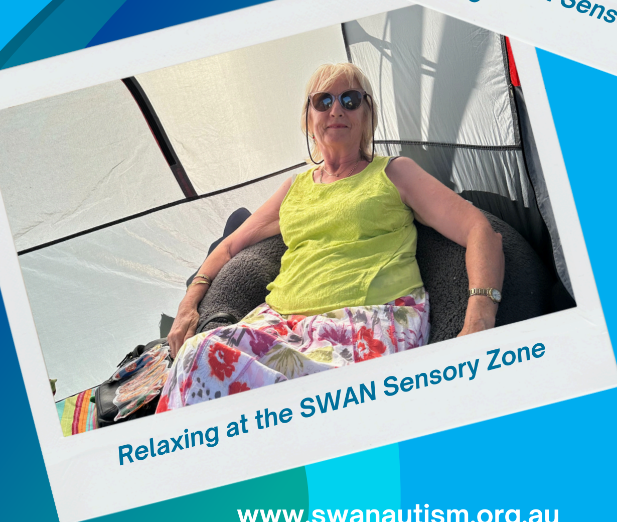
Relaxing at the SWAN Sensory Zone